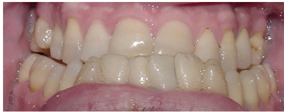
With pontic and aligner