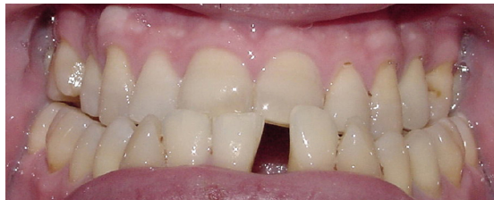
Without pontic and aligner

Goal: Camouflage unsightly spaces during aligner therapy