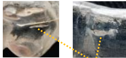
Competitor's retainer showing cracks that occurred after three weeks of nighttime-only wear.